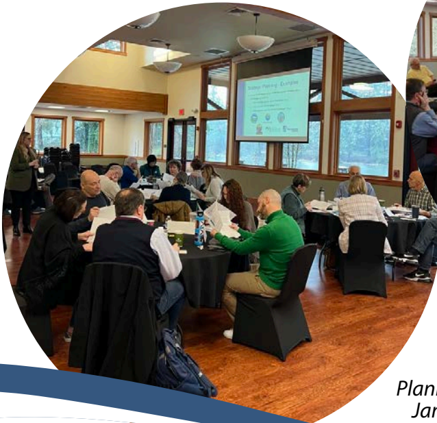
Planning Council January 2024