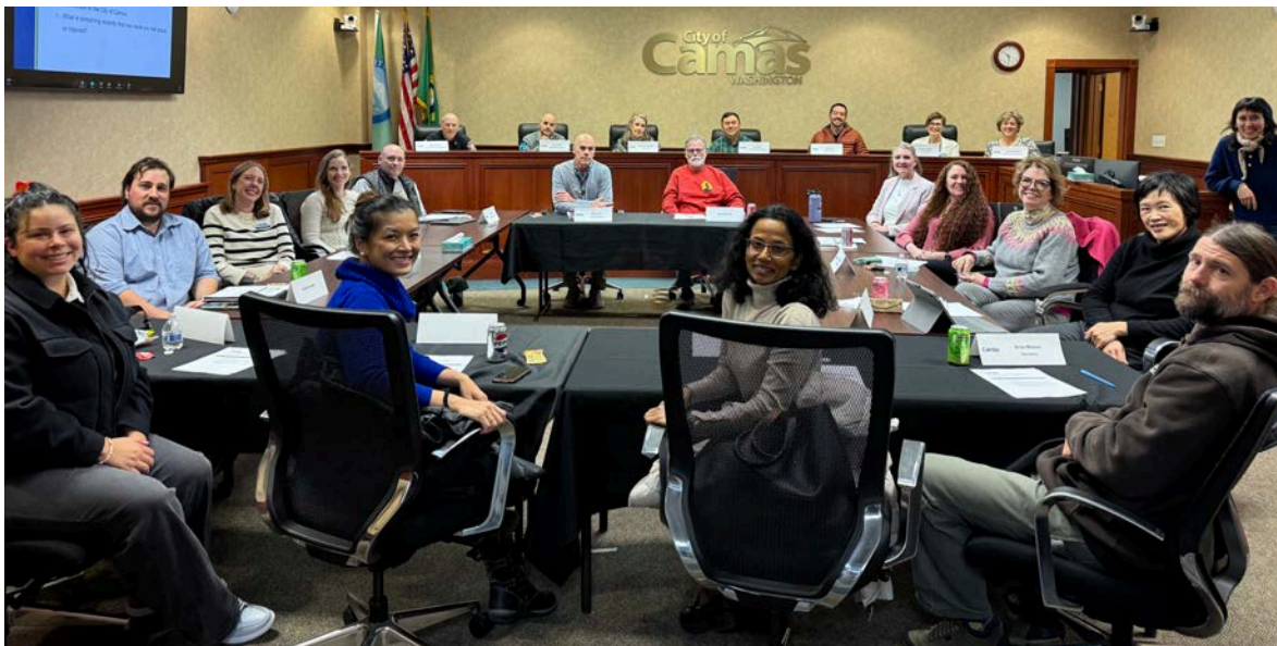
Community Advisory Committee and City of Camas Department Heads Meeting February 2025

Following the community engagement phase, PointNorth reviewed the engagement themes and findings with the Community Advisory Committee in January 2025. The CAC provided recommendations on proposed values, vision statement, and priorities. At the January 2025 planning retreat, City Council and City Department Heads achieved consensus on City values, vision statement and priority areas and priority area definitions. Between January and April 2025, City Department Heads, City Leadership and the Community Advisory Committee supported the refinement of goals, potential actions and key performance indicators for the final strategic plan. A final meeting with Community Advisory Committee members took place in March 2025, providing the community the opportunity to give input on the final plan before adoption.