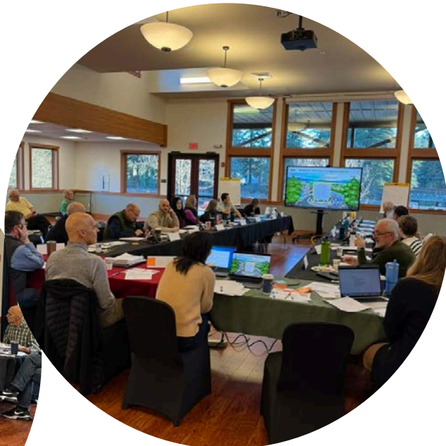
Planning Council January 2025